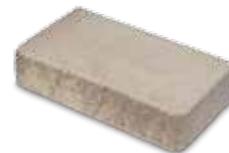
MINI CAP UNIT 4"h x 18"w x 10.5"d 48 pieces per pallet